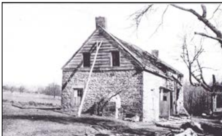
The old stone farmhouse, probably about 1912. Image from Bloomfield Old and New.

On the other hand there are those who believe that the “stone house” was not only built by human hands before 1696, but that it is still standing and in use. The house referred to stands near the south bank of Stone House Brook just across the Montclair boundary line and north of Bellevue Avenue... 2