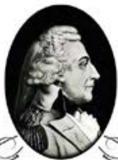
General Joseph Bloomfield