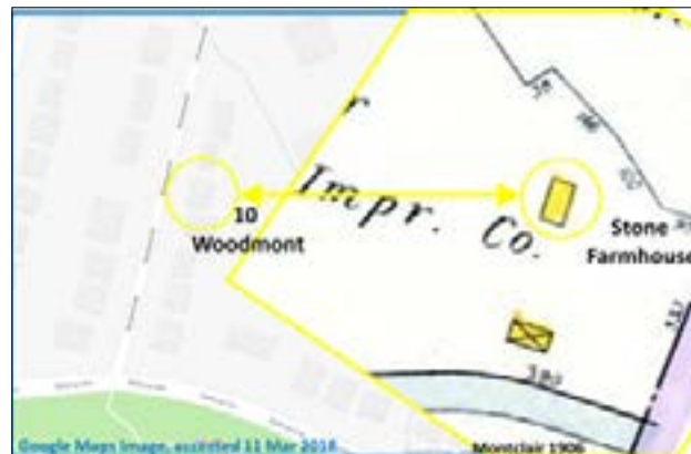
Comparison of a Google map (left) and the corresponding section of a 1906 map of Montclair, rotated to closely match the orientation (top).

Oral traditions often distort history, but in this case, an antique deed corroborates the lore of the Great Rock of the Yantecaw plains as the eponymous Stonehouse. Analysis shows that the farmhouse, while too recent to have been the namesake, has nonetheless left a tangible reminder of its own historical significance. The stories of the defunct Rock and its neighboring farmhouse advance our understanding of early human habitation of Brookdale and afford a rare glimpse of the age when natives and pioneers roamed Stonehouse Plains. Footnotes on following page.