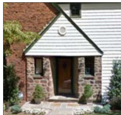
Google Street View of the doorway of the house at 10 Woodmont Rd, Montclair.