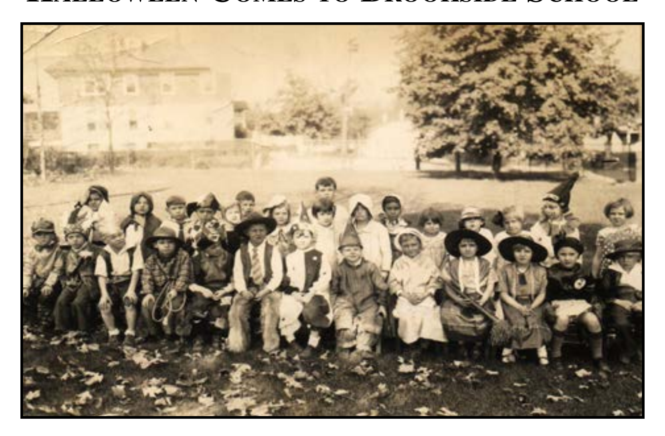
Brookside School 1st Grade Class Halloween Picture, circa 1933.

Even in the depths of The Great Depression, Brookside Elementary School (which has since been converted into Brookside Manor Apartments) didn't stint on Halloween fun and class photos.