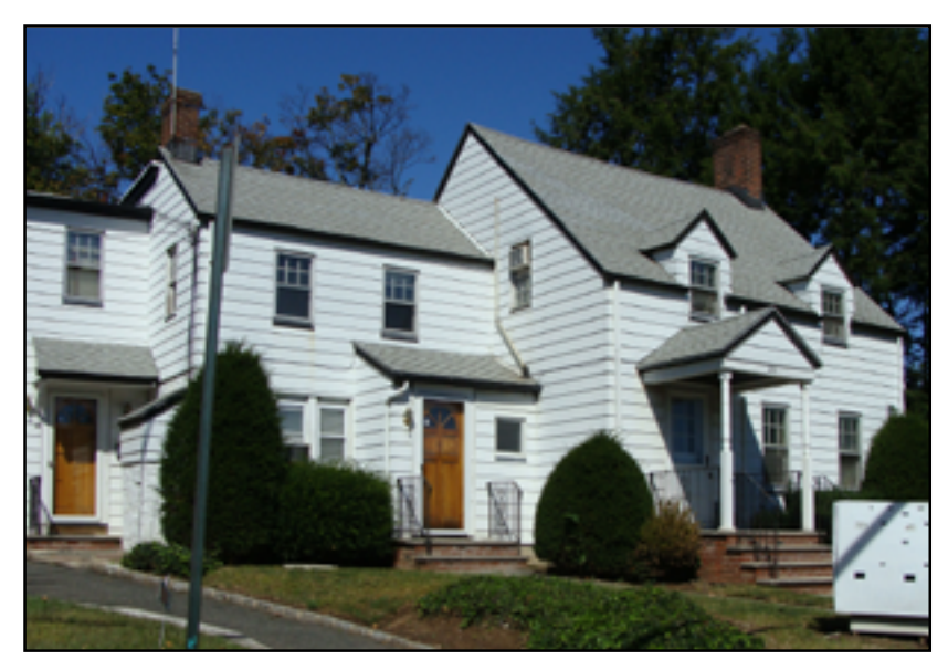
The Ball House in 2013.