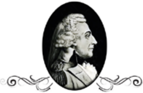
General Joseph Bloomfield