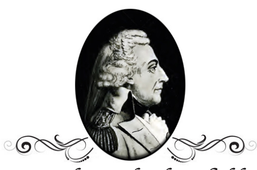
General Joseph Bloomfield