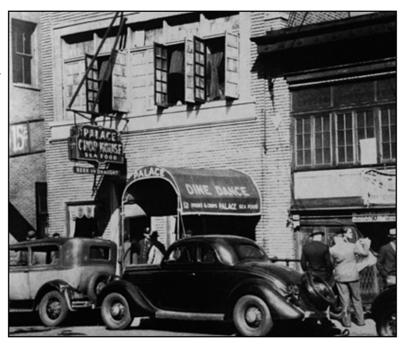
The Palace Chop House in Newark, NJ.

We don't know the particulars, but whenever The Dutchman was arrested, and he was often arrested, our houses were frequently put up as bail, simultaneously in different courts, since the lack of modern communication meant that there was no way to check from one municipality to another. In 2023, the property contains four three-family homes and a workshop, but during the time that Schultz was