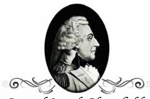
General Joseph Bloomfield